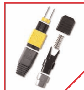
▲ MPO Jacketed