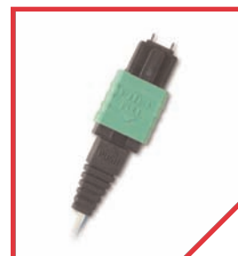
▲ MPO Bare Ribbon