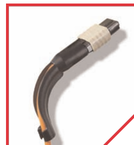
▲ MPO 90 degree boot